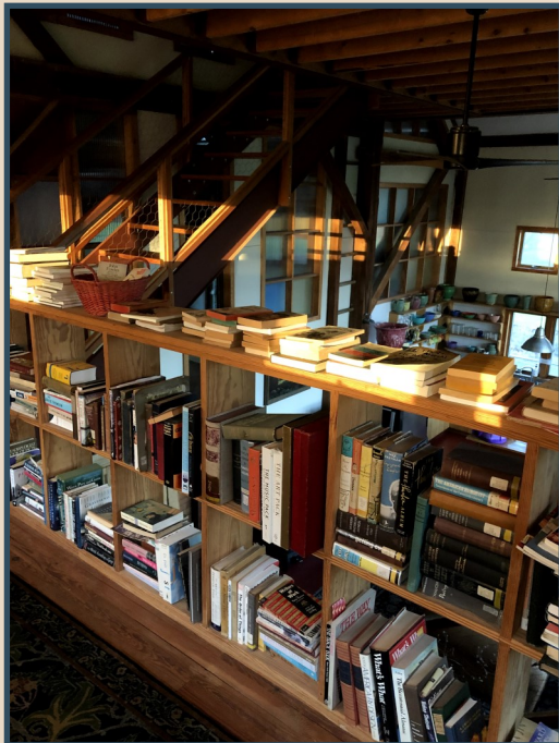
The door to the converted barn, and the interior. Funded by anonymous donors, the Good Contrivance Farm Fellowship is awarded twice a year, offering a two-night writer's retreat to a PRWR student interested in creative writing.